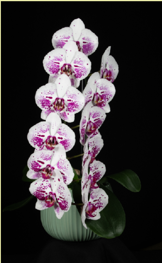
Phal Fuller's Lady AM_89pts.