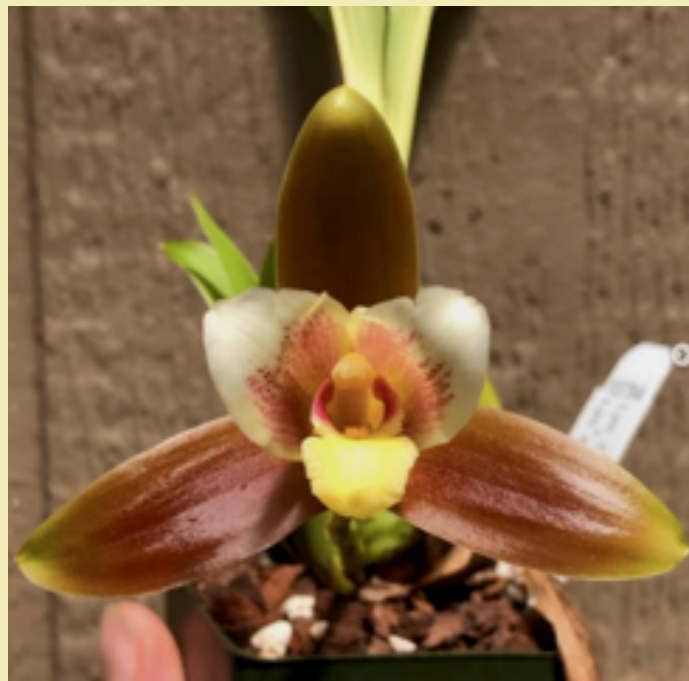
Lycaste Goldenrod, Tim's cross of Lyc. dowiana x Corrimal