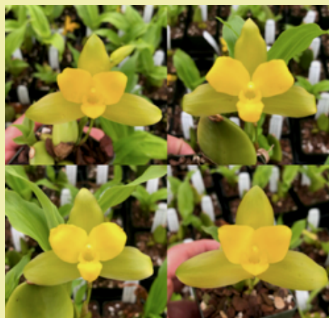
Four examples of Lycaste Belle Ribicoff, Tim's cross of macrobulbon x Suave

The Dove library will be on your left and there is a large, well-lit parking lot. The Gowland Meeting Room is located on the right hand side of the main entrance. Hit the hyperlink above for a map.