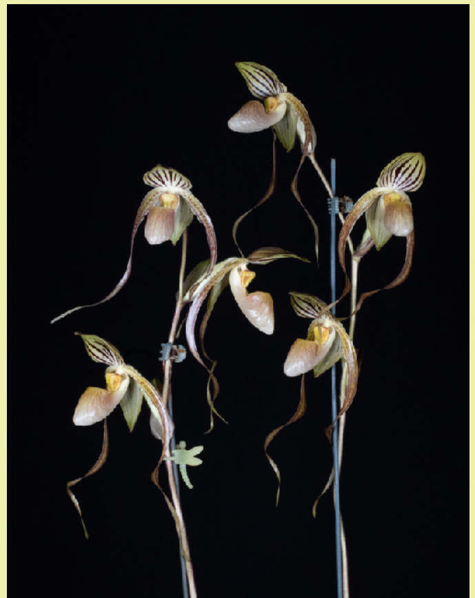
Paph. Boucles Blonds HCC_76pts.