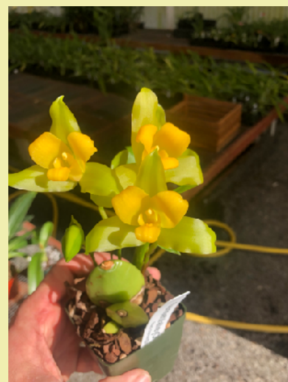
Lycaste Buttercup, Tim's cross of Corrimal x Suave