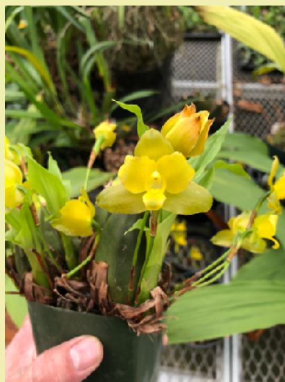
Lycaste Primrose, Tim's cross of dowiana x campbellii