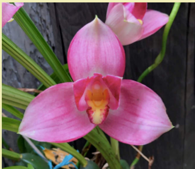
Lycaste Spring Performer