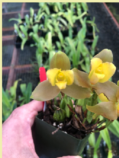
Lycaste Buttercup, Tim's cross of campbellii x Corrimal